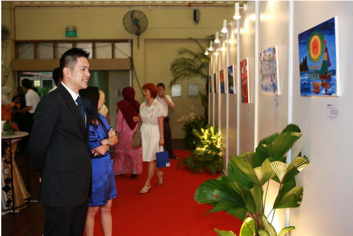
Guests of the evening previewing the art pieces by residents of Muhammadiyah Welfare Home before the auction.