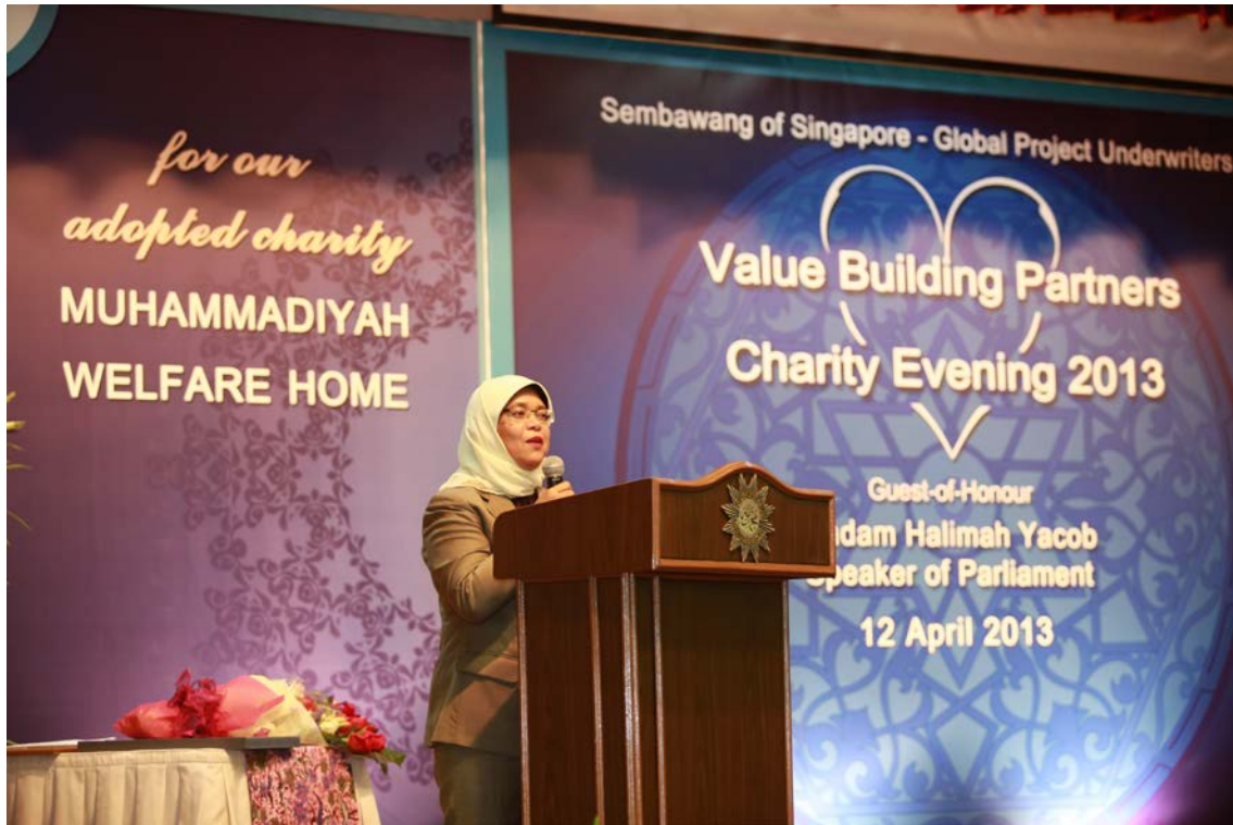
Guest of Honour, Madam Halimah Yacob, Speaker of Parliament delivered her speech for the event